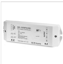
3104163 RGBW WIFI controller 4 channel (0.35A each CH)