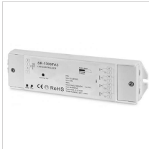
3104173 RGBW RF controller 4 channel (0.35A each CH)